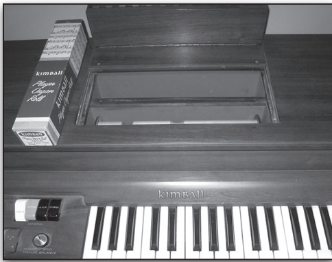
1960s Kimball player organ. In working condition. Some valves need work. $500