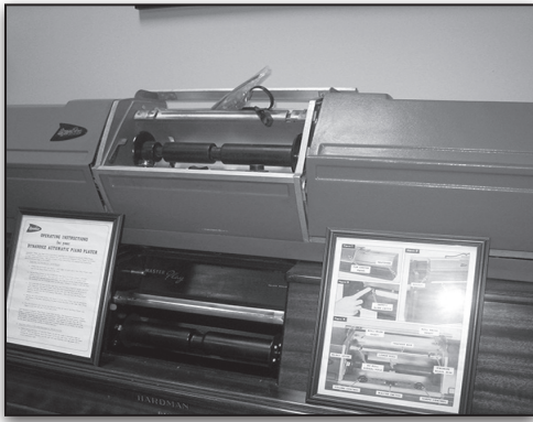
Dynavoice key-top player unit and two framed pictures. Unrestored $150