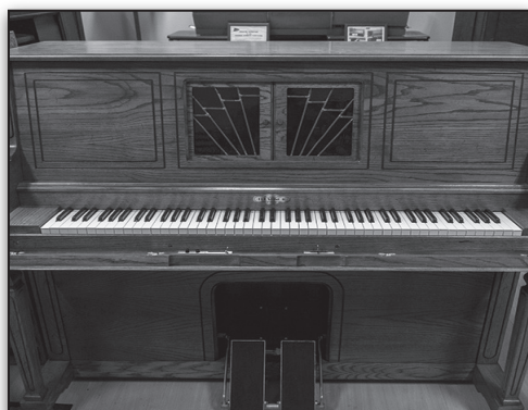
1983 Sting II with automatic rewind and shut-off. Reduced from $2600 to $1200.