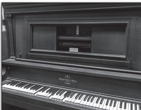
Raudenbush Player Piano with Autopiano player system. One of three piano companies based in Minnesota. Good unrestored condition. $200