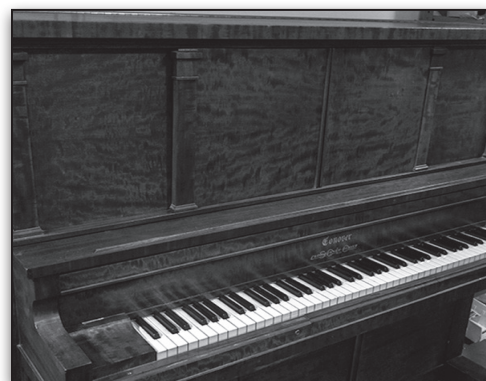
Conover Cable Inner Player. One of the best designed player pianos ever manufactured. XL unrestored condition. $300