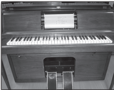
Small 65 note Pianola Players. Perfect for small home or apartment. Two models to choose from; manual pump. $400

This piano is not on site. For additional information contact Craig Swager: 651-486-6914.