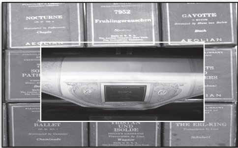
Set of 36 Pianolist's Themodist-Metrostyle Piano Rolls Very good original condition. $225