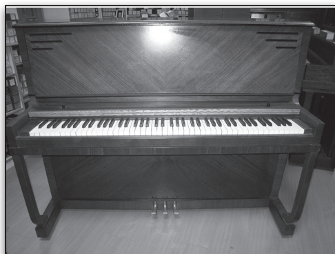
This is not a player piano, but a rare and unique Art Deco styled 44" Gulbransen console piano $950