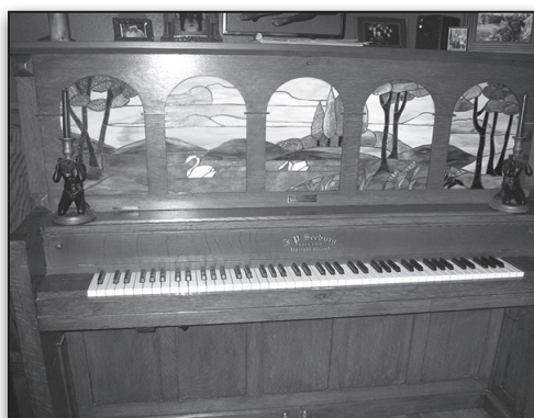
Seeburg Digital player piano. The best of two centuries. 1920s Seeburg Nickelodeon with the revolutionary 21st Century Pianomation CD system with remote transmitters. Extensive music library. $4500.

This piano is not on site. For additional information contact Craig Swager: 651-486-6914.