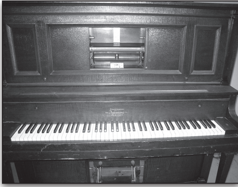
Autopiano Conservatory Player Piano. This model is one of the few players that is manual pump and electric pump (not vacuum). Very good unrestored condition. $500