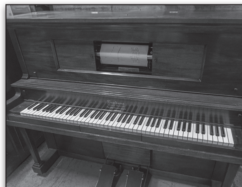
Euphonia Inner Player by Cable. This is one of the finest restored player pianos we have ever had. New hammers, case professionally refinished. Only $2900