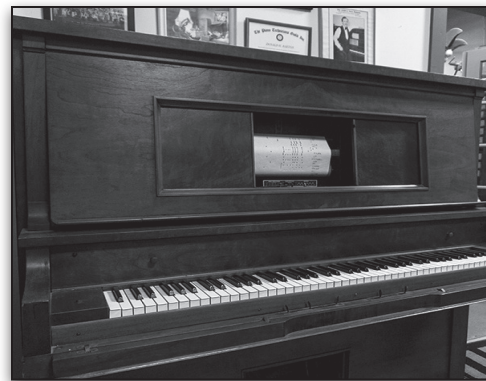
Holland upright player piano. Refinished and restored with electric vacuum system. $450

Saturday, September 8 | 1:00–5:00 PM | 1915 E. 22nd St. | Minneapolis. 55404