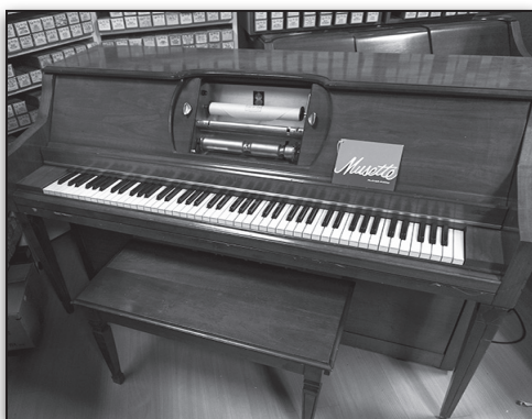
Duo Art by Aeolian. Automatic rewind and shut-off. $450